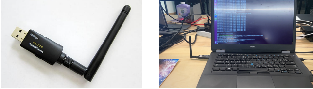
(a) A Panda PAU06 300Mbps Wireless USB Adapter. (b) A laptop with an external wireless USB Adapter.